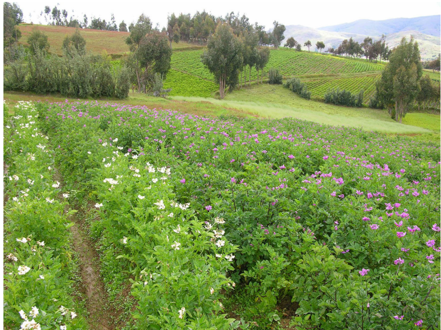
Fig. 2 Coexistence of landraces and commercial potato in farmers' fields in the Peruvian Andes (La Libertad). A landrace producing a yellow-fleshed tuber, 'Papa Amarilla' ( white flower on left ), is grown alongside the variety 'Yungay' ( purple flowers on right )

past hybridization events were most likely to have occurred (Fig. 1). Fields were sampled in several provinces and communities within these regions (Table 2). In farmers' fields, we sampled all landraces grown and, in some cases, also the commercial potato 'Yungay' as referred by the farmers themselves.